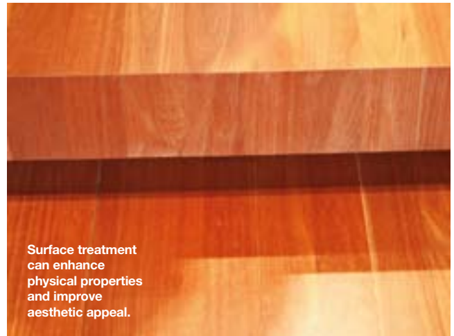
Sherrill Thiel, San Francisco, US

Colour values for both control and treated wood samples have been studied for each of the five different species. The results have shown a certain effectiveness of the anti-UV