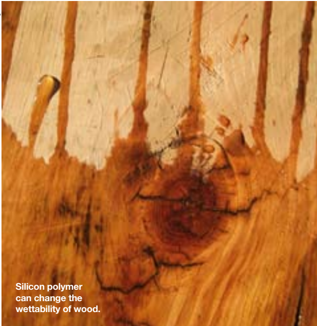
Silicon polymer can change the wettability of wood.

However, the UV irradiation appears to change surface yellowness of coniferous species more than hardwood species. The anti-UV treated hardwood surfaces (chestnut and cherry) yielded higher gloss than the anti-UV treated softwoods (pine and fir).